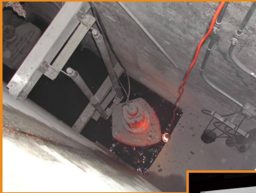
Kwik-Lift Wet Well Removal System (facilitates inspection & service)