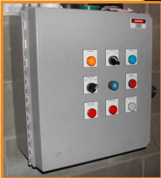
Reverse Clearing Controller