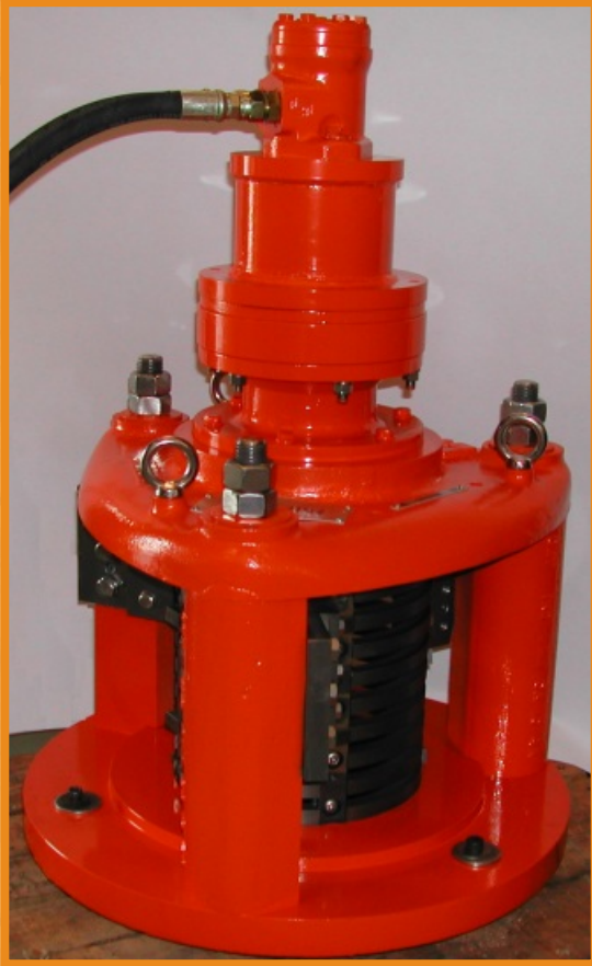
Grind Hog™ 10LH Prior to Shipment & Installation