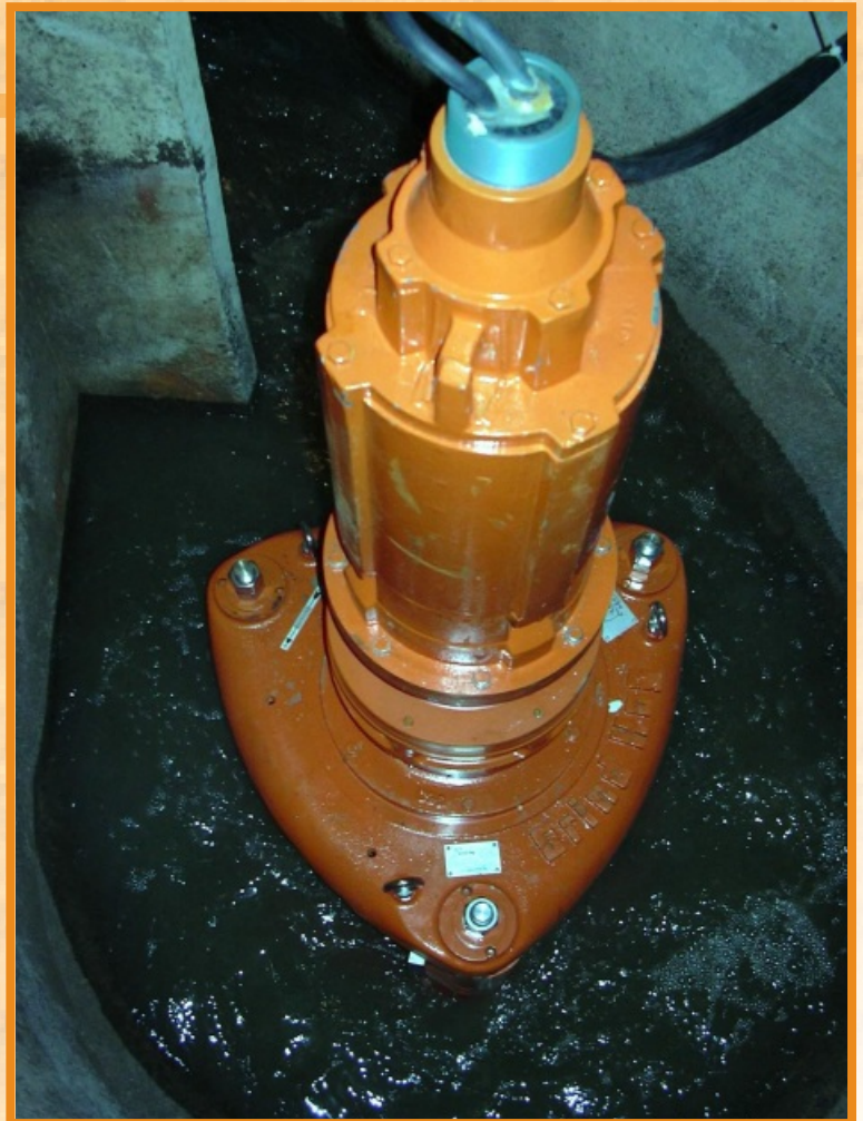
Basin of previously installed Chicago Pump 25M