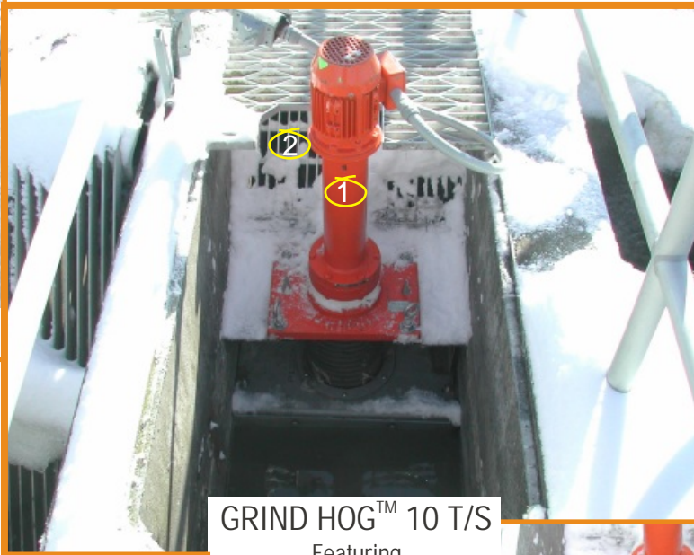
GRIND HOG™ 10 T/S Featuring 1) 18" Motor Column 2) Overflow Barscreen

The Greer Galloway Group, Inc. 86 River Road South, Corbyville, Ontario